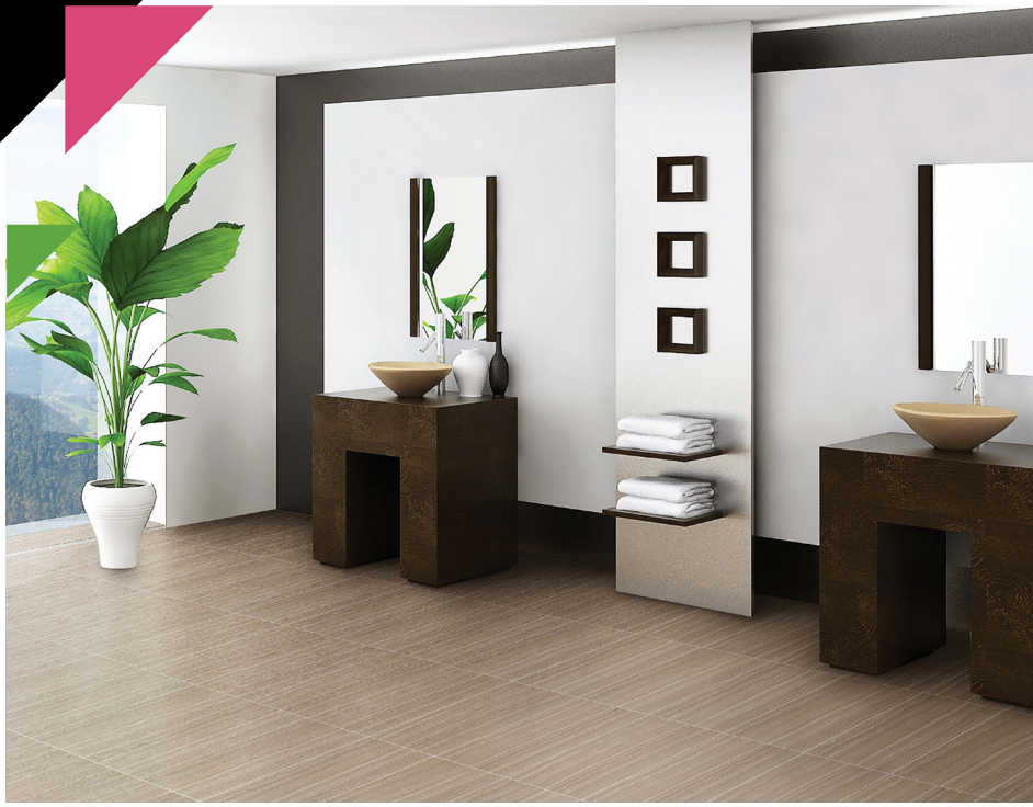
INSTALLATION PHOTO Ecolinea Porcelain – Greige – FLSRI741