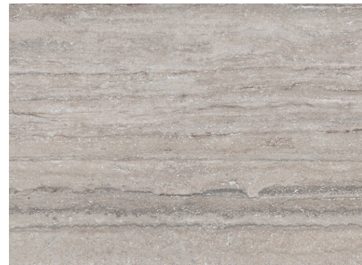
12" X 24" – FLSRI633 24" X 48" – FLSRI635 MOTTLED PLATINUM