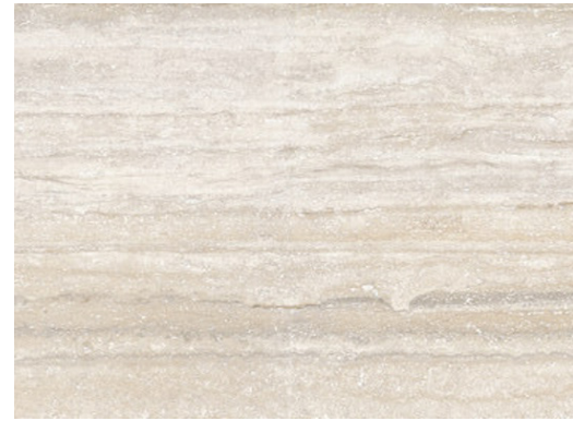
12" X 24" – FLSRI630 24" X 48" – FLSRI632 MOTTLED BLANC