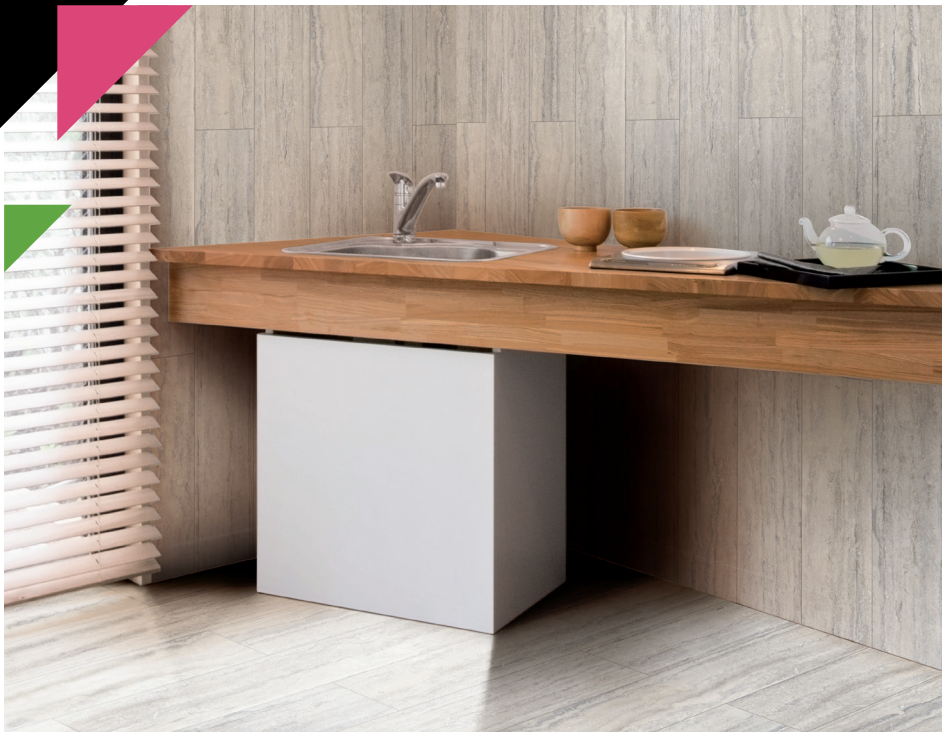
INSTALLATION PHOTO Aegean Travertine Porcelain – Mottled Blanc – FLSRI630