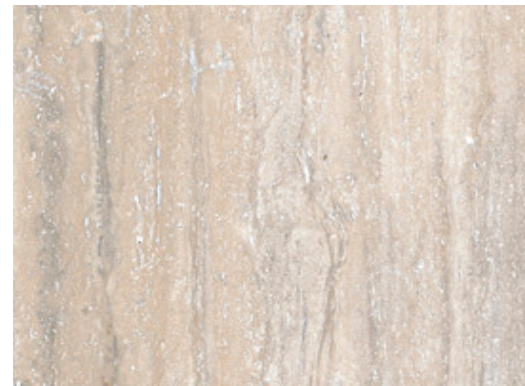
12" X 24" – FLSRI636 24" X 48" – FLSRI638 MOTTLED BEIGE