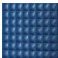
The Venue - Le Bain - Custom DSBUS414